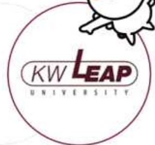
Chosen as Autonomous Contract University for the University Innovation Support Project